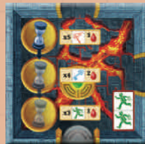
2x Lava chamber