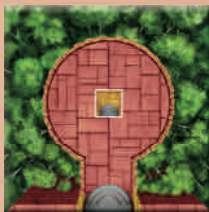
1x Moving platform