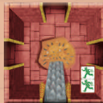
1x Slide trap