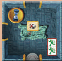
1x Sacrifice chamber