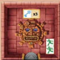
1x Invocation chamber