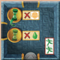
4x Prohibition chamber