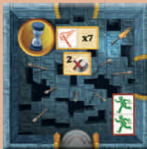
1x Torch chamber