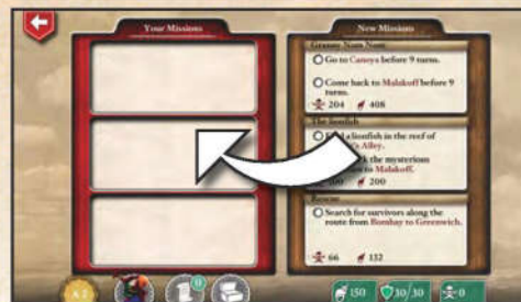
Port Barrack screen, drag and drop missions from right to left to accept them.

When you fail or abort a mission, vengeance missions may be offered to other players. These missions are always combat missions.