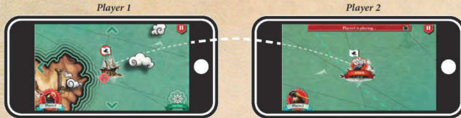
Player1 can attack Player2 by tapping on the "Attack" button of his opponent's screen.

The active player clicks on the attack button on the player's phone he wants to combat.